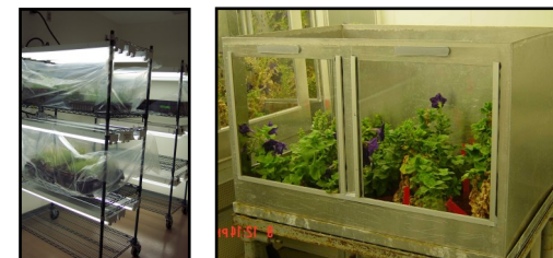
There are many containment systems available for transgenic plant research.

Growing plants need to be contained to prevent the dissemination of genetic material. This can be achieved by covering or removing flower and seed heads to prevent seed dispersal, harvesting plant material prior to sexual maturity, or utilizing male sterile lines. Various commercial containment systems are available or inexpensive systems can be constructed with disposable plastic sheeting. These systems contain seeds, soil, plant parts resulting in less housekeeping and less contamination between shelves. These systems also provide better humidity control resulting in less watering of plants.