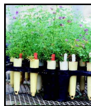
Transgenic plants should be clearly labeled to distinguish them from non-transgenic plants.

All transgenic seeds and plants should be clearly identified and labeled to distinguish them from other stored seeds, plants, or materials. If transgenic and non-transgenic plants must be grown in the same location, such as an open lab or mixed use greenhouse, all work must be completed at the biosafety level approved for the transgenic plant work.