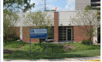
Environmental Quality Management Center

To provide outstanding service to the RESEARCH, ACADEMIC, OPERATIONAL and HEALTHCARE areas of the University in defining and achieving their goals for environmental compliance and resource conservation.