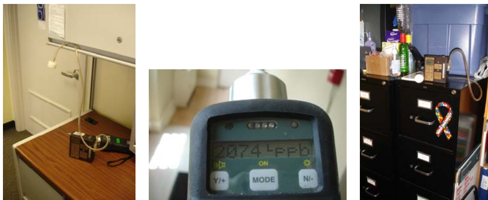
Sampling pumps with treated glass-fiber filters (left, right) and a photo-ionization detector (center) were used to measure exposures in the 170 suite.

In order to determine the potential exposure levels to isomers of TDI within the 170 suite during the roofing operation, sampling pumps were deployed to take environmental samples on 6/7/11. One pump was placed at the front reception desk, and collected samples for a total of 390 minutes in order to determine compliance with the Occupational Safety and Health Administration (OSHA) 8-hour Permissible Exposure Limit (PEL). Another pump was placed on top of a file cabinet in the office of J. Birdwhistell and R. Johnson, and was used to collect two 15-minute samples to determine compliance with the OSHA Short-Term Exposure Limit (STEL). All pumps were pre-calibrated at 1.0 liters per minute flow rate, and post-sampling calibration checks revealed that no drift had occurred during sampling. Per the instructions of the analytical laboratory, modified OSHA-42 method was used with treated glass-fiber filter cassettes, sampled open-faced. Analysis for both 2,4-TDI and 2,6-TDI was requested. Galson Laboratories in East Syracuse, NY was the analytical laboratory.