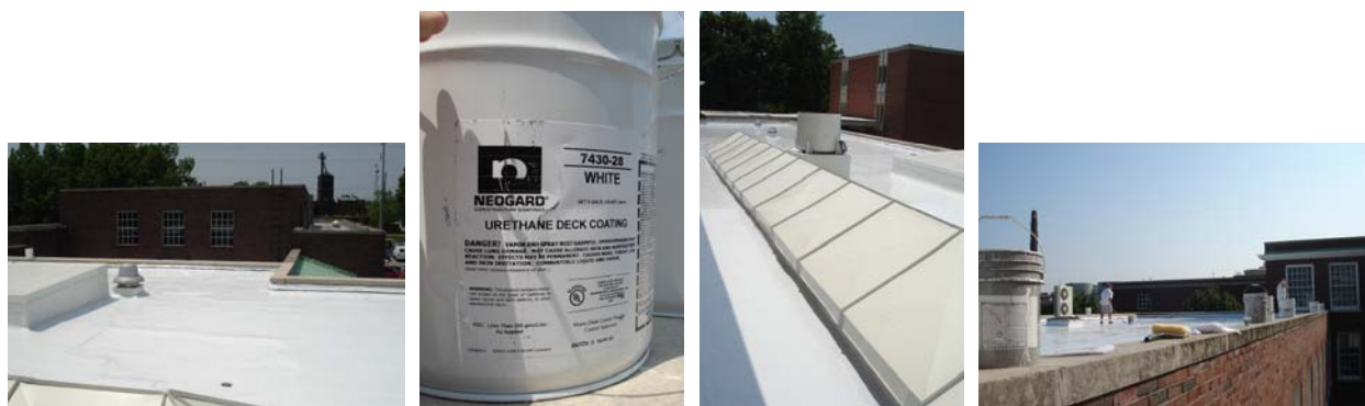
Photos of various segments of the Taylor Education Building roof receiving a urethane deck coating

The crew applied the coating using paint rollers with extension poles. Because vapors from this coating are heavier than air, they tend to sink below the roof level and were thus detectable within certain areas of Taylor with a portable photo ionization detector (PID). Two coats were applied to all flat sections, with the second coat not applied until the roof was completely dry from the first coat as well as subsequent dew/condensation.